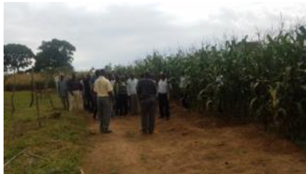
3 - Field visit during MCVS Community Engagement event

MCVS team also sourced some relief food items to share with those in need during this unprecedented time of the COVID-19 pandemic. Participants also received from well-wishers some sanitary gloves which can be distributed within their respective villages in order to reduce the spread of COVID-19 through hand contact during funerals.