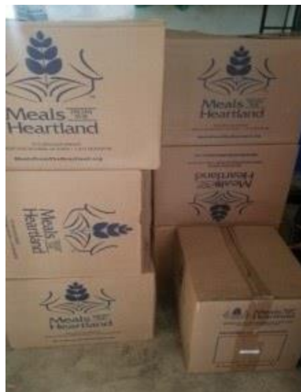
4 - Cartons of relief food