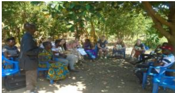
10 - The Community Development Officer of Abia Sub-County welcomes and briefs the students