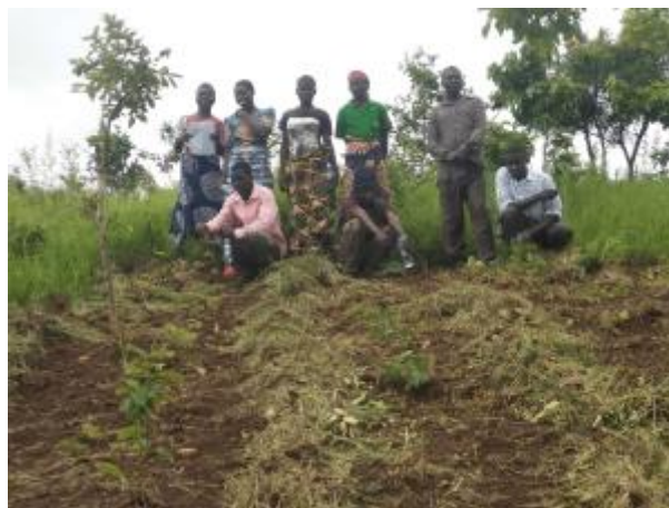
2 - Community members involved in tree planting