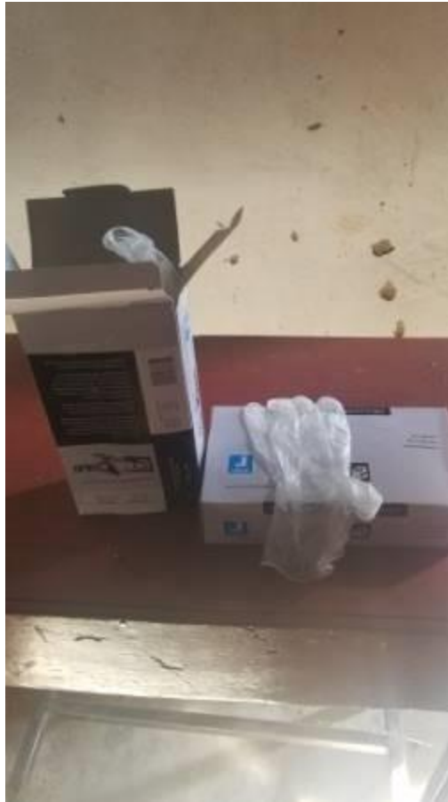
5 - Cartons of sanitary gloves