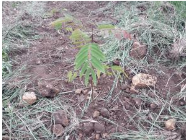
1 - Acacia tree that has been planted