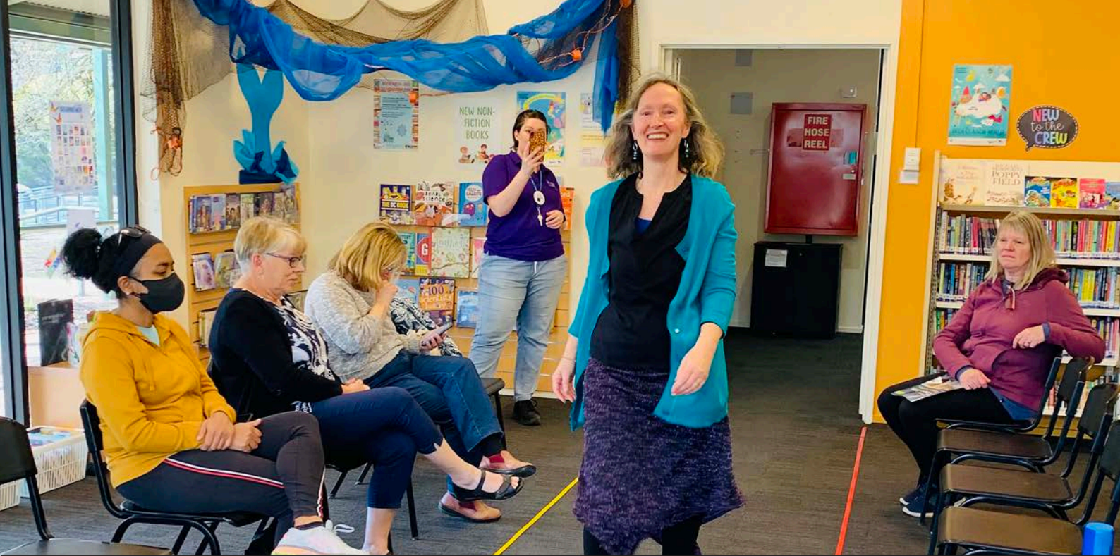
First Impressions Clothing Exchange (FICE) hosted a fashion parade to promote the range of training and support available to empower women to achieve their employment goals.

'Some people can be daunted by the prospect of adult education,' said Renee, 'but you're never too old to learn or adapt.'