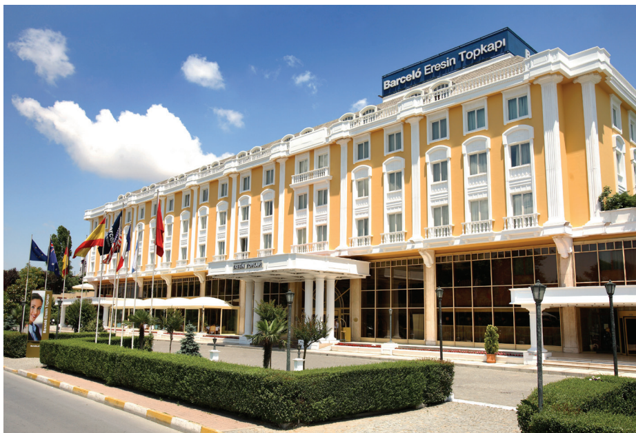
The conference venue Barceló Eresin Topkapi Hotel

This hotel in the Barceló Premium category boasts spacious, light-filled rooms, a fantastic health and wellness centre (1,000 m 2 ) the U-Spa, a conference centre and free Wi-Fi connection in all the rooms and common areas. The hotel also boasts its own Hammam (Turkish bath) to help you discover the traditions of this fascinating country.